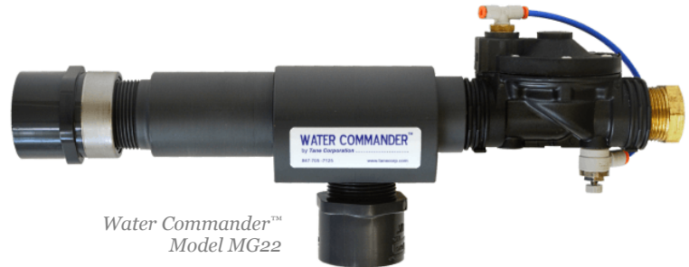
Water Commander™ Model MG22