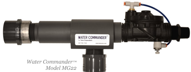
Water Commander™ Model MG22